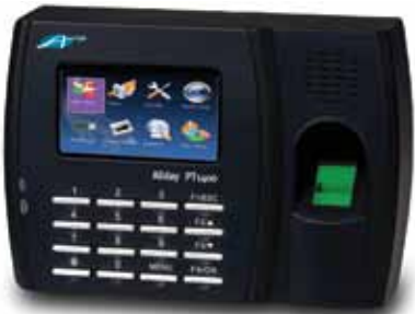
Allday Time Systems PT1400

Suitable for all types of small business of up to 100 employees.